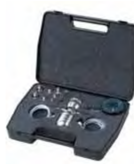
Low pressure pneumatic test kit

Includes: DPI 104-IS; ranges to 10,000 psi (700 bar), PV 411A combined pneumatic and hydraulic test pump, hydraulic reservoir, hose, adaptors, seal kit and case.