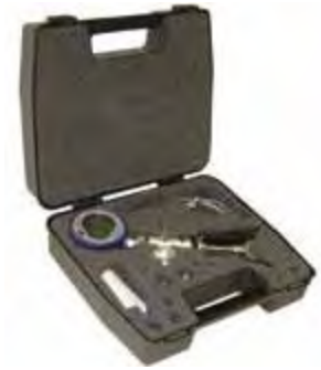
Pneumatic test kit