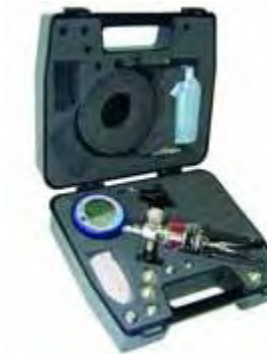
Hydraulic test kit