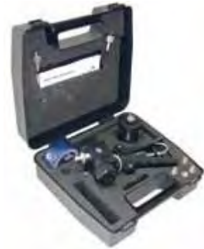
Pneumatic and hydraulic test kit