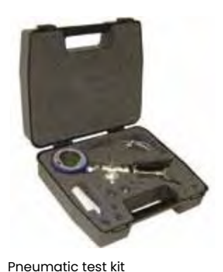
Low pressure pneumatic test kit