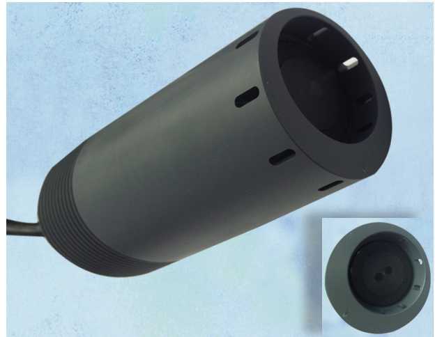
Submersible Turbidity Sensor

The Q-Blast Auto-Clean assembly is housed in a NEMA 4X enclosure suitable for indoor or outdoor use. The system includes an integral compressor and air-pulse control components, with a power supply for the entire air supply system incorporated into the design. A simple connection to the Q46/76 monitor provides the sequencing for the system and allows the operator to select cleaning frequencies as often as once every hour to as little as once every 999 hours. To insure performance in extreme cold conditions, a thermostatically controlled heater is included in the assembly, allowing operation down to -40°C.