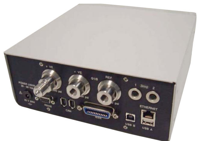
PACE1000 from the rear