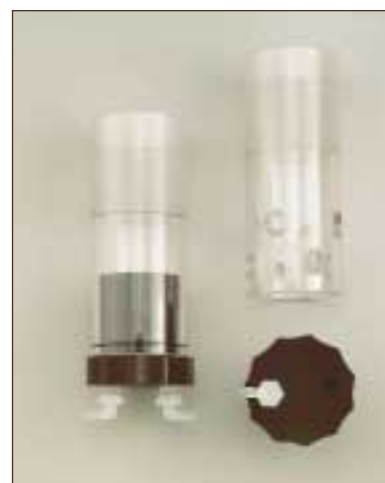
Splash Guard and Flowcell Assembly

Flowcell Assembly: For applications requiring sample draw systems, the flowcell seals the sensing module and permits the addition of inlet and outlet fittings to pipe sample into and out of the sensor.